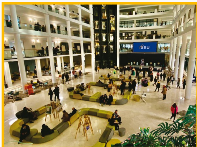
UNIVERSITY ENTRANCE HALL